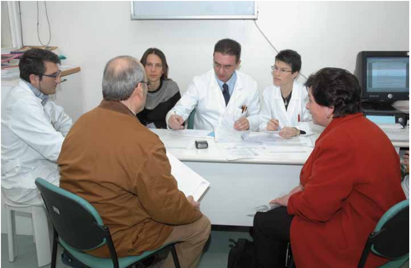
Exploring all the options. Patients seen by the Prostate Cancer Unit at Milan's Istituto Nazionale Tumori have an initial consultation with the full range of specialists, including a urologist, radiation oncologist, medical oncologist, psychologist and nurse

states to ensure that all women in the European Union have access to treatment in specialist breast units, certified according to quality criteria set down by the European Society of Breast Cancer Specialists.