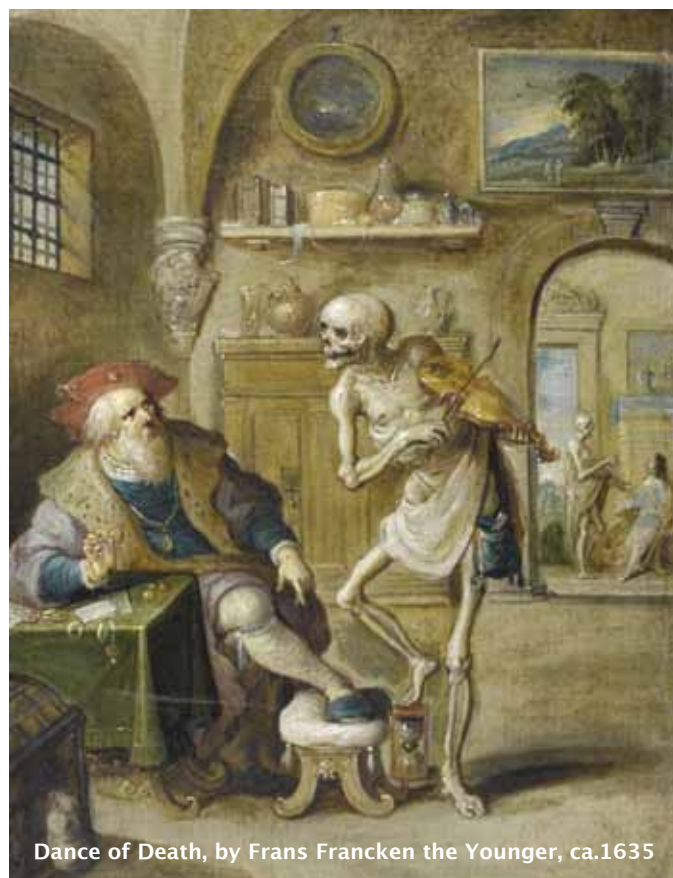
Dance of Death, by Frans Francken the Younger, ca.1635

Death, he says, is “an affliction... more marked by pain, fear, boredom and absurdity than by dignity, spirituality and meaning.” People who are dying, he argues, are often “too tired, too spent, to be spiritual” – a sentiment that will no doubt be appreciated by people who feel they are being