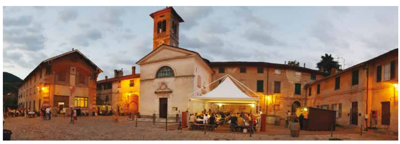
A long way from the Institut Jules Bordet. The beautiful Ligurian village of Ferrania (Cairo Montenotte), population 600, where Lambertini learned to love medicine

for breast cancer might raise the risk of recurrence, with almost one in three respondents indicating they thought it might. "Not true," says Lambertini. "On the basis of available evidence, pregnancy after completing treatment and follow-up can be considered safe even in patients with oestrogen-receptor [ER]-positive breast cancer – the most hormonally driven form." That evidence includes an international case-control study of 333 women with a history of ER-positive breast cancer who became pregnant (matched 1:3 to non-pregnant patients of similar characteristics), which was published last year with Lambertini as lead author ( JNCI 2018, 110:426–29)